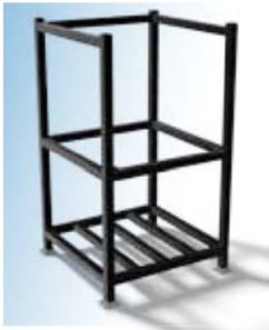
PCB3636 Handling/Storage and Transportation Cage For bulk tanks. Painted black. 36" w x 36" d x 64" h (outside dimensions) 32" w x 32" d x 57" h (inside dimensions)