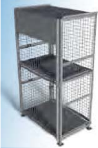
PCSC-B1-GP 39" w x 27" d x 72" h 1 removable shelf