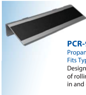
PCR-9533 Propane Cage Ramp Fits Type A, B & D Designed for the ease of rolling heavy cylinders in and out of the cage.