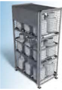
PCSC-B2 39" w x 27" d x 72" h 2 removable shelves