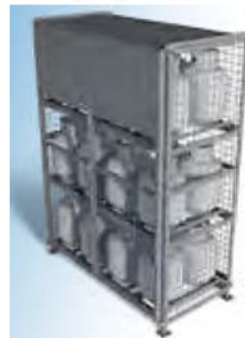
PCSC-D2 51" w x 27" d x 72" h 2 removable shelves