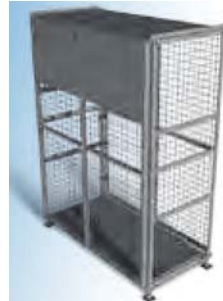
PCSC-D-O/A 51" w x 27" d x 72" h