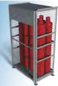
PCSC-B-O/A 39" w x 27" d x 72" h