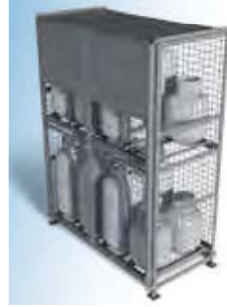
PCSC-D1 51" w x 27" d x 72" h 1 removable shelf