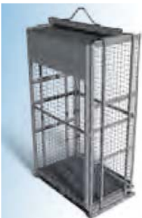
PCCL-B Certified Lifting Device 45" w x 28" d x 82" h