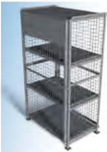
PCSC-B2-GP 39" w x 27" d x 72" h 2 removable shelves