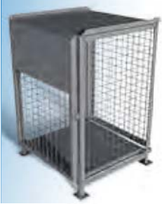
PCSC-A-S-GP 27" w x 27" d x 40" h