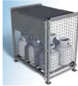
PCSC-A 39" w x 27" d x 40" h