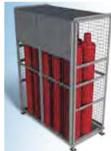
PCSC-D-O/A 51" w x 27" d x 72" h