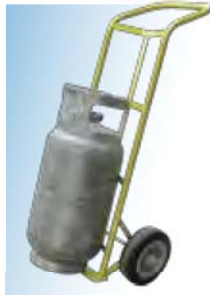
CD-2346 Cylinder Dolly Designed for various sized cylinders, beer kegs etc. Short Bottom blade for easy loading and unloading.