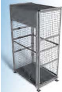
PCSC-B-O/A 39" w x 27" d x 72" h