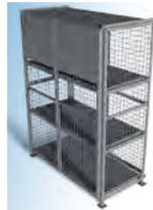
PCSC-D2-GP 51" w x 27" d x 72" h 2 removable shelves