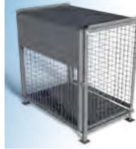
PCSC-A-GP 39" w x 27" d x 40" h