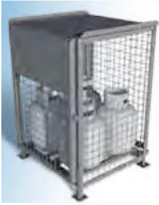
PCSC-A-S 27" w x 27" d x 40" h