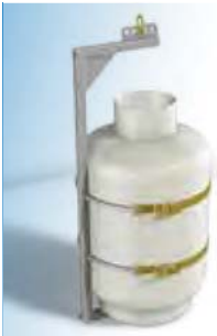
PTLD-60 Propane Tank Lifting Device Designed for safe, easy and quick loading and unloading