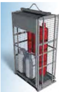
PCCL-B Certified Lifting Device 45" w x 28" d x 82" h