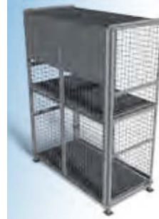
PCSC-D1-GP 51" w x 27" d x 72" h 1 removable shelf