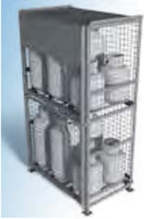
PCSC-B1 39" w x 27" d x 72" h 1 removable shelf